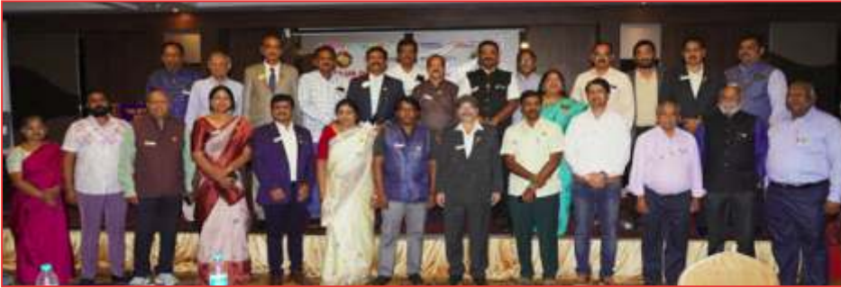
50 Club Officers Donors came forward to support the LCIF MJF/PMJF Recognition Program at the Club Officers' Schooling in Hotel RG Royal, Yeshwantpur on 27 July 2025