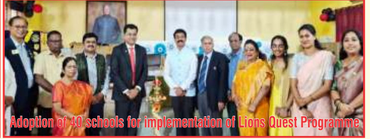
Adoption of 40 schools for implementation of Lions Quest Programme