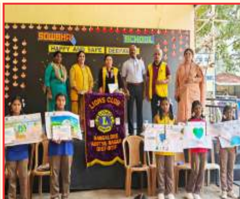
LCB Adityanagar Peace Poster