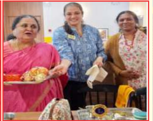
LCB Bandhavya Tea for Elders