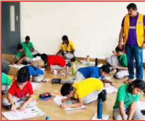
LCB Harmony Peace Poster