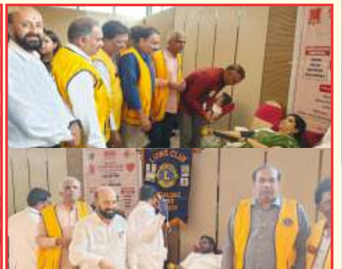
LCB Metro Blood Donation Camp