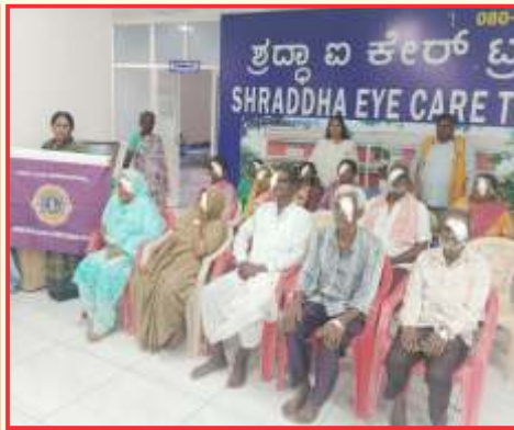
LCB Pegasus & LCB Sanjaynagar IOL Surgery