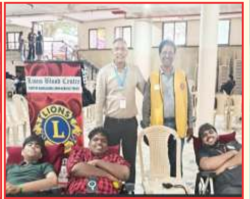
LCB Jayamahall Blood Donation Camp