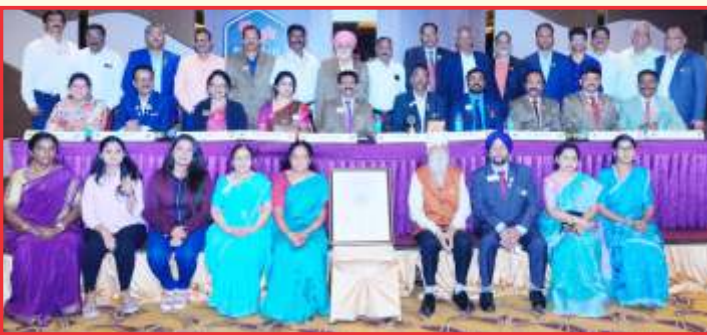
LCB PEENYA DASARAHALLI