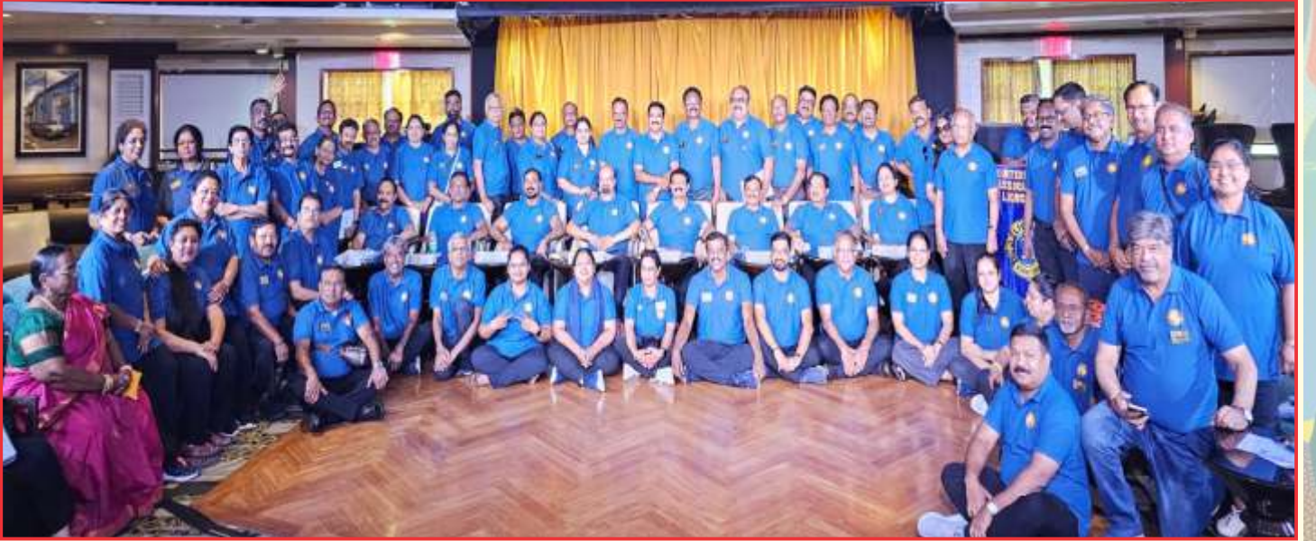
Second Cabinet Meeting aboard Cordilia Cruise the Empress. 14-10-25