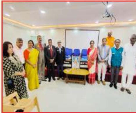
LCB Yelahanka Pride Elders Day