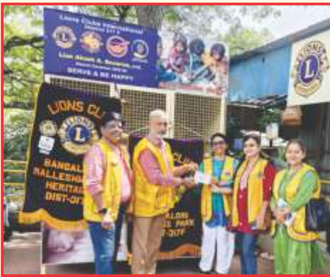
LCB Maleswaram Heritage LCB Queen's Park - Hunger Relief.