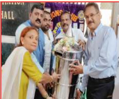
LCB Arvind Nagar Temple Donation of Hundi